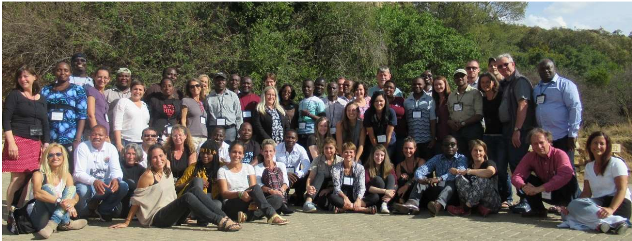
Leaders of wildlife centers throughout Africa gathered for PASA's conference in South Africa.

The Pan African Sanctuary Alliance (PASA), the largest association of wildlife centers in Africa, includes 23 organizations in 13 African countries. Our members are securing a future for Africa's primates by fighting the illegal wildlife trade, rescuing and rehabilitating orphans of the trade, educating the public, empowering communities, and protecting critical habitat. PASA strengthens our member organizations and works to build a global movement to save Africa's great apes and monkeys.