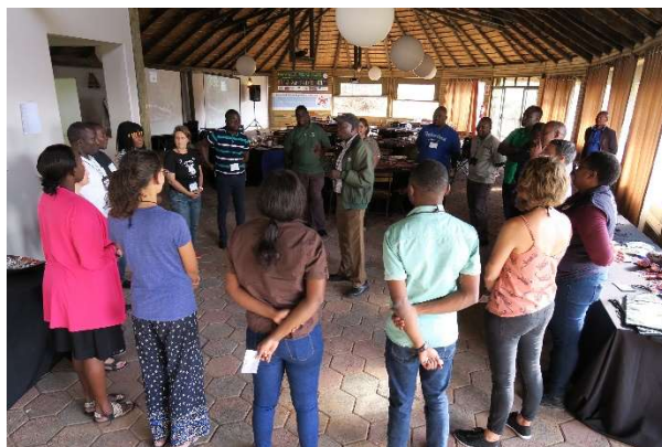
A teambuilding activity during the Community Engagement Workshop.

The Strategic Development Conference and Community Engagement Workshop were made possible by generous grants from the Arcus Foundation , the Columbus Zoo and Aquarium , the Columbus Zoo AAZK Chapter , Fondation Brigitte Bardot , FOUR PAWS , the International Fund for Animal Welfare (IFAW) , the Louisville Zoo AAZK Chapter , the Memphis AAZK Chapter , the New Mexico Biopark Society , and the Pittsburgh Zoo & PPG Aquarium .