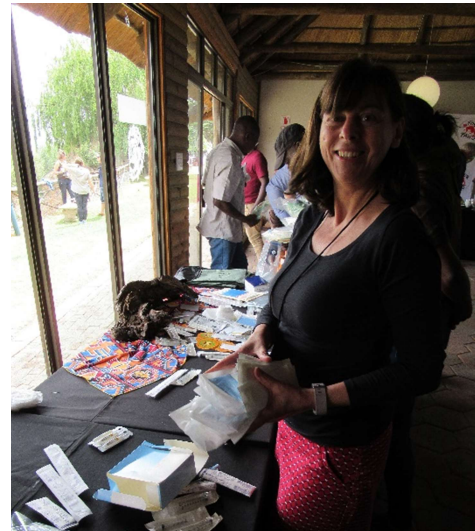
Conference and workshop participants sorted through boxes of donated uniforms and veterinary supplies generously provided PASA International's conservation partners.