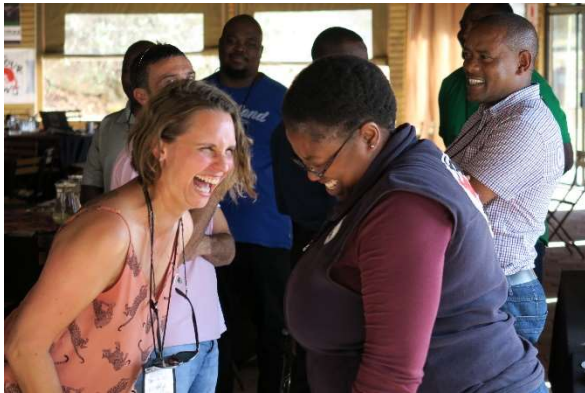
Conference participants made meaningful connections, strengthening the Alliance across Africa to collaborate and protect endangered wildlife.

During a discussion about tuberculosis, it was clear that every primate sanctuary represented at the conference is concerned about TB. There was a consensus to collaborate with researchers at the University of Minnesota to train sanctuary vets and standardize sanctuaries' procedures for testing and treating TB.