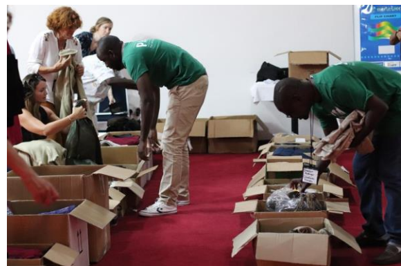
Sanctuary leaders sort through boxes of uniform donations provided by the Barcelona Zoo.

Before the start of the conference, Barcelona Zoo sent a very generous supply of zoo uniforms to Tacugama Chimpanzee Sanctuary to arrive in time for the conference. This significant donation – the single largest donation of zoo uniforms in PASA's history – allowed the directors and managers to bring much-needed boots, work pants, gloves, and work shirts to their sanctuary staff. Several sanctuaries were able to provide uniforms for their entire staff!