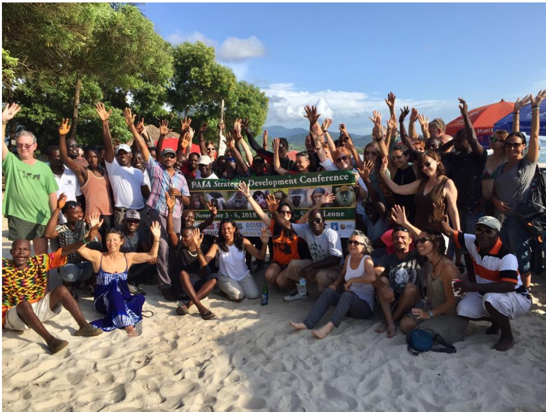
Leaders of African wildlife centers gathered for PASA's four-day conference in Sierra Leone.

The Pan African Sanctuary Alliance (PASA), the largest association of wildlife centers in Africa, includes 23 organizations in 13 African countries. Our members are securing a future for Africa's primates by fighting the illegal wildlife trade, rescuing and rehabilitating orphans of the trade, educating the public, empowering communities, and protecting critical habitat. PASA strengthens our member organizations and works to build a global movement to save Africa's great apes and monkeys.