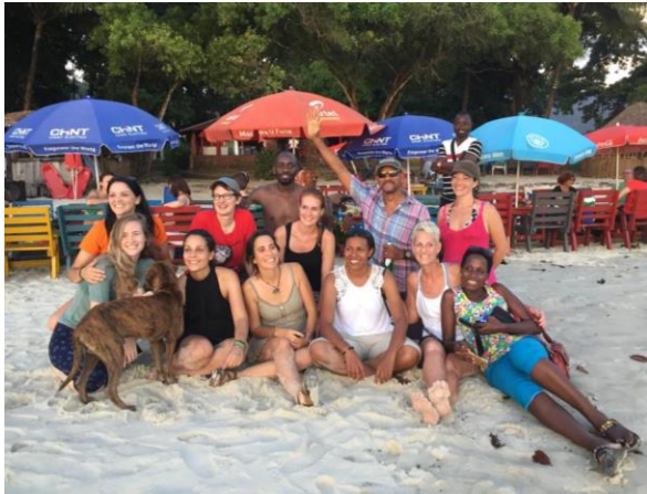
Conference participants enjoy an evening at River Number 2, a community eco-project in Freetown.

located in Cameroon agreed to provide veterinary and management consultation to Papaye, which is also located in Cameroon.