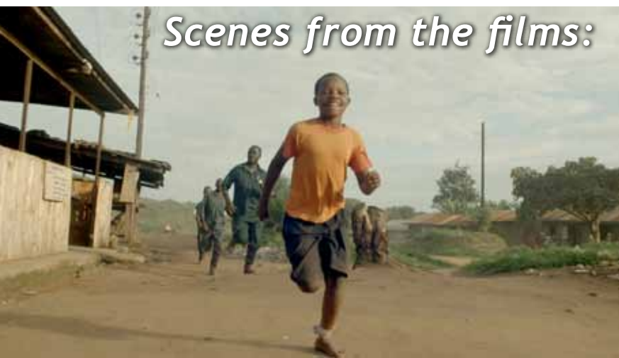
Scenes from the films:

We're growing: We now have access to 20 empowering films that build compassion for animals and teach African audiences about the threats facing wildlife.